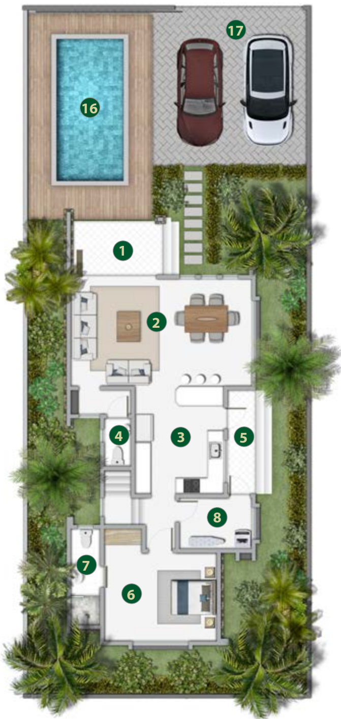
GROUND-FLOOR 95.55 m 2